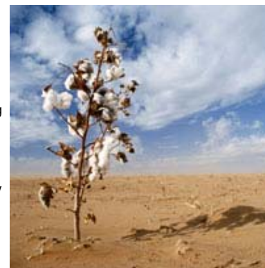
Cotton paying a high price for water

Copyright © 2008 The Economist Newspaper and The Economist Group. All rights reserved.