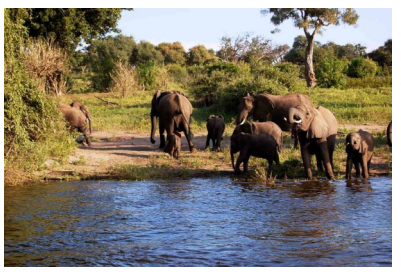
Even they let every member know when trouble is near. Be alert.

Put your backpack on your front, arms through straps and clasped in f