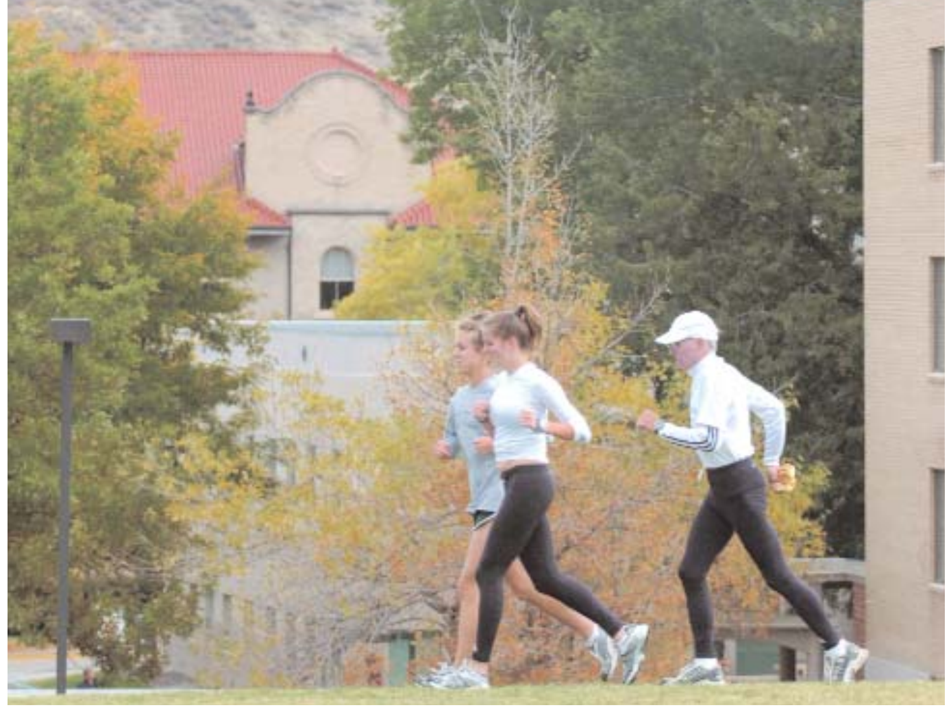
*Students/parents/guardians are encouraged to keep this brochure throughout the 2010-11 academic year as all on-campus services are available to CSM students, regardless of whether they are enrolled in the SHBP.

Coulter Student Health Center Counseling Center at Student Development and Academic Services Student Health Benefits Plan (SHBP) Athletic Trainer for Intercollegiate Athletes Health Education and Wellness Programs