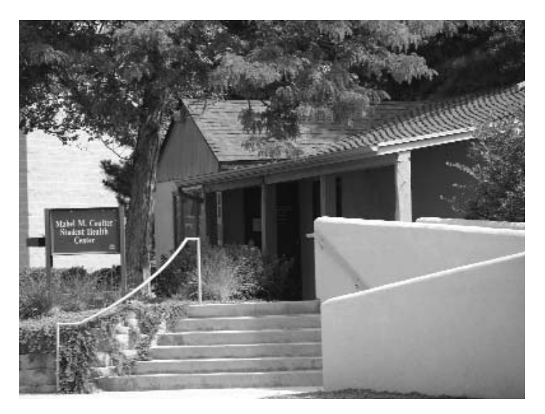
Health Center. <u>The Student Health Center does not</u> provide services for children, faculty, staff or campus <u>visitors.</u> Students may only be seen during the session in which they are enrolled and paying fees.

Students who are enrolled in at least four credit hours pay a Health Center fee which allows access to services provided at the Student Health Center. Spouses and domestic partners may be seen at the Health Center, for the same per semester fee as students. Spouses/domestic partners do not have access to dental services provided at the Student