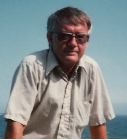
Fig. 1. Peter Cary Waterman (1928–2012).